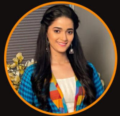
Siddhi Sharma Model / Actress