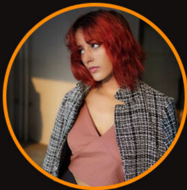
Torsha Deryn Model / Actress