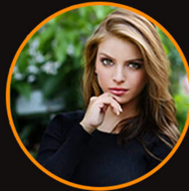
Urusha Pandey Model / Influencer