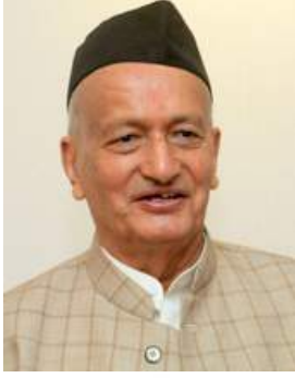
BHAGAT SINGH KOSHYARI GOVERNOR OF MAHARASHTRA