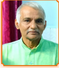
Chief Guest Dr. Prakash Amte