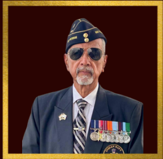
COMMANDER VIJAY VADHERA NM ( Gallantry)